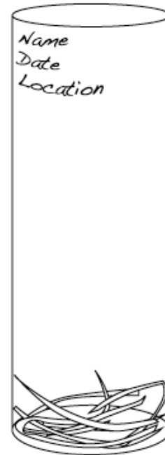
First add your slow-release carbon source (if using).